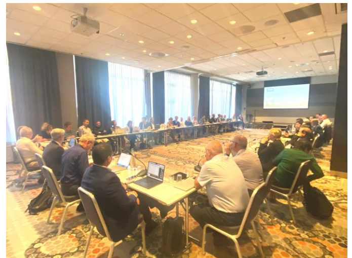
The General Assembly in progress.

The GA members are increasing every year as new Countries join the IAAS as Full Members.