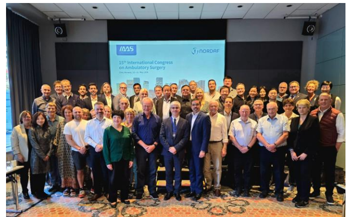
GA Members, 44 in all! And growing!

Correspondence: One Day Surgery Center-Babulnath Hospital, 15, Sadguru sadan, Opp. Babulnath Mandir, Mumbai-400 007